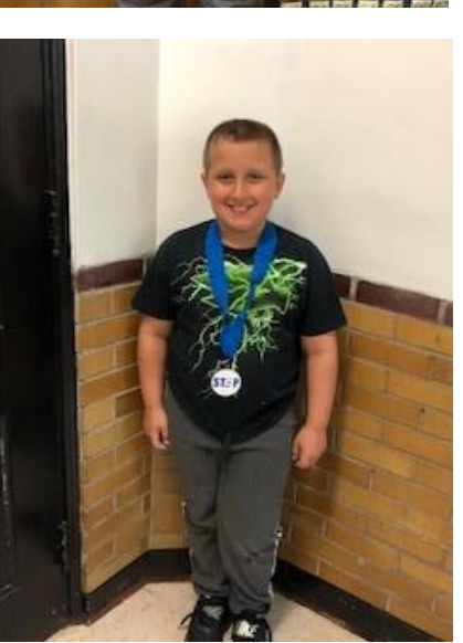
Artist of the Week